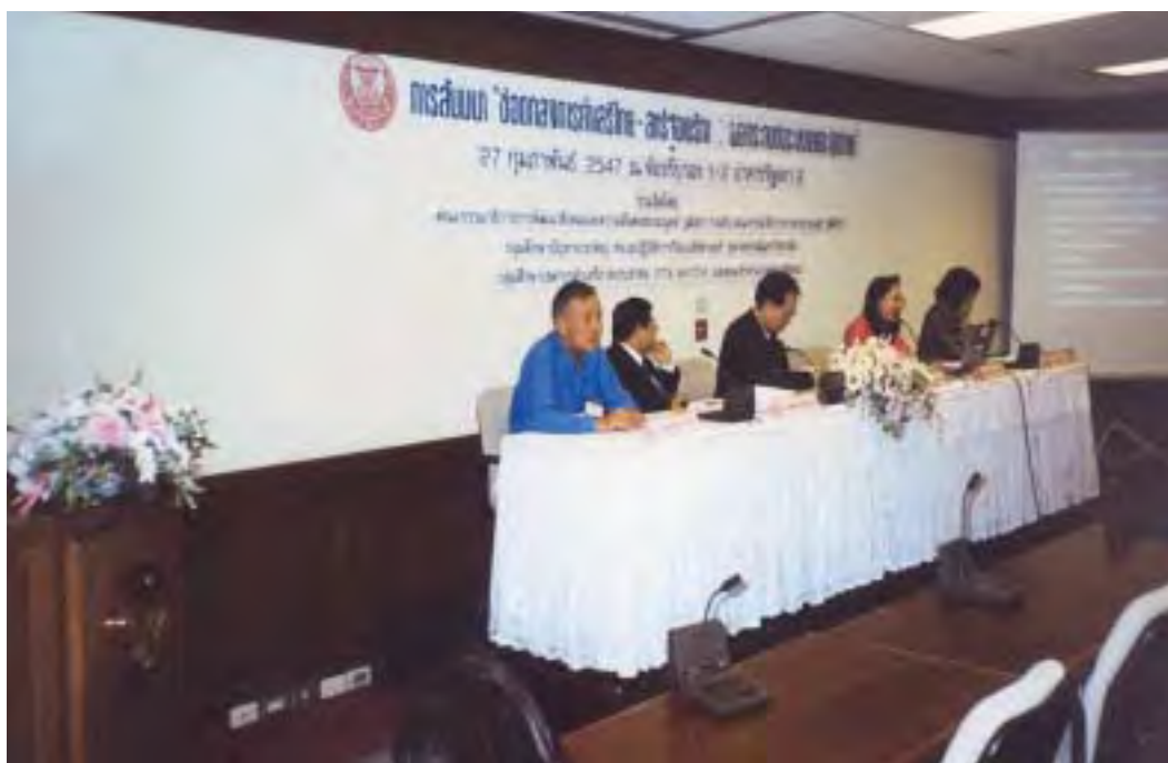
Resource persons addressing the participants at the National Workshop on FTA between Thailand and the US: impact to drug and health system, Bangkok, Thailand in Feb 2004. HALAP was one of the organizers of the national workshop