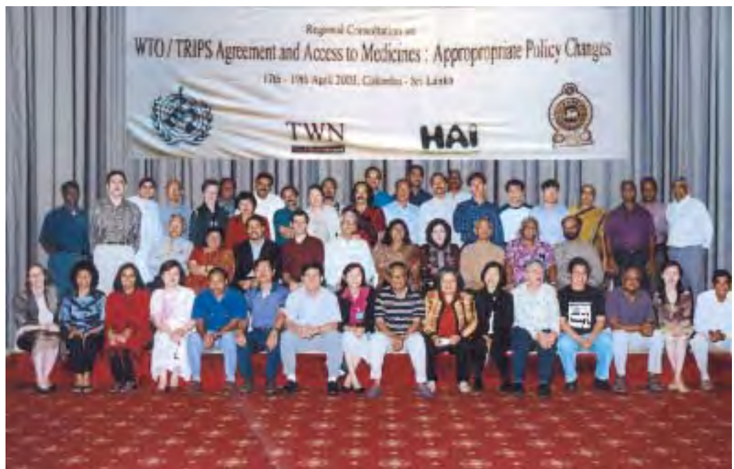
Participants of the Regional Consultation on WTO/TRIPS Agreement and Access to Medicines: Appropriate Policy Responses organized by HAIAP in collaboration with TWN and SEARO/WHO pose for a group photograph at the Colombo Plaza, Colombo, Sri Lanka in April 2003