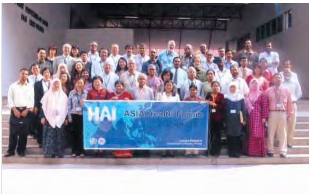
Participants of the 2005 Asia Health Forum organized by HAIAP in Penang, Malaysia pose for a group photograph