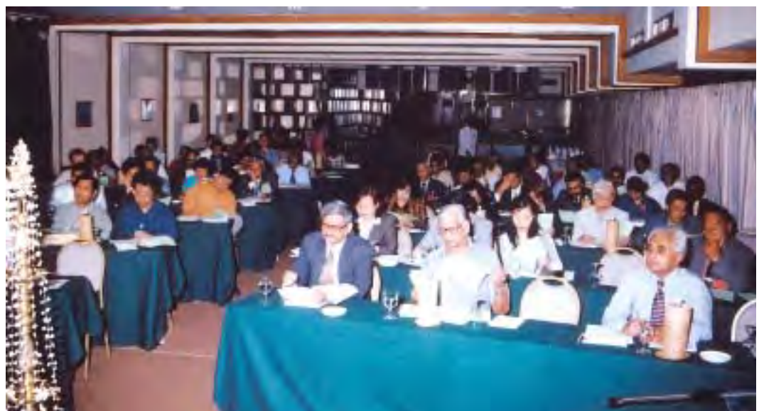
Participants of the Regional Consultation on WTO/TRIPS Agreement and Access to Medicines: Appropriate Policy Responses during one of the sessions