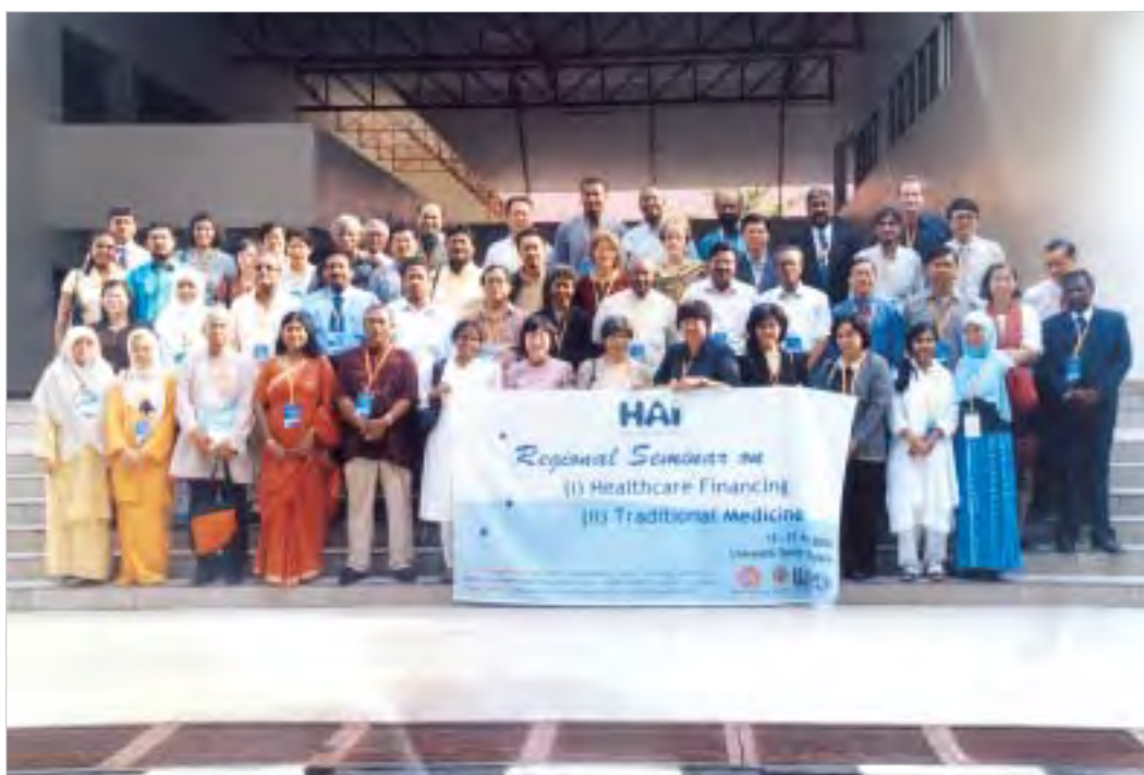
Participants who attended the Regional Seminars on Healthcare Financing and Traditional Medicine organized by HAIAP pose for a photograph at the University Sains Malaysia, Penang, Malaysia in 2003