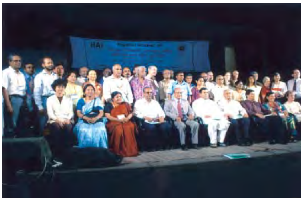
Participants, during the 25th Anniversary celebrations of HAI at the Regional Seminar on “The future of health services: who will live and who will die” pose for a group photograph in Gonoshasthaya Kendra, Savar, Dhaka, Bangladesh, 10 - 12 April, 2006