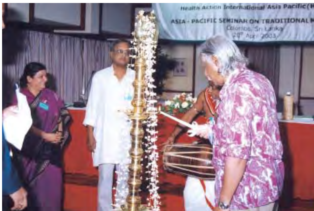
The lighting of the traditional oil lamp by HAIAP Members at the Asia Pacific Seminar on Traditional Medicine organized by HAIAP in April 2003 in Colombo, Sri Lanka