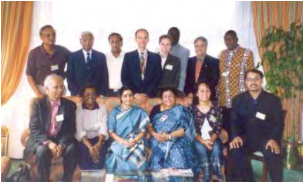
The HAIAP team meeting with Sushma Swaraj, Honourable Minister of Health, India after the World Health Assembly in 2003