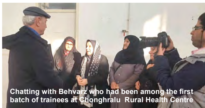
Chatting with Behvarz who had been among the first batch of trainees at Chonghralu Rural Health Centre

During the situation analysis, it had been found that 80% of the common curative problems of the people during the previous two weeks were from six complains like cough/ common cold, diarrhoea, eye infections, osteo-muscular pains, abdominal pain -later categorized by physicians into 10 diagnosis including upper respiratory infections, gastroenteritis, conjunctivitis, etc..