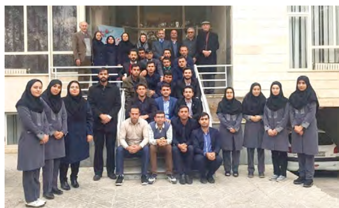
Current CHWs under training at Behvarz Training Centre that was established in 1972.

The Board, with our technical support, tried to extend the program to all other places where there was no