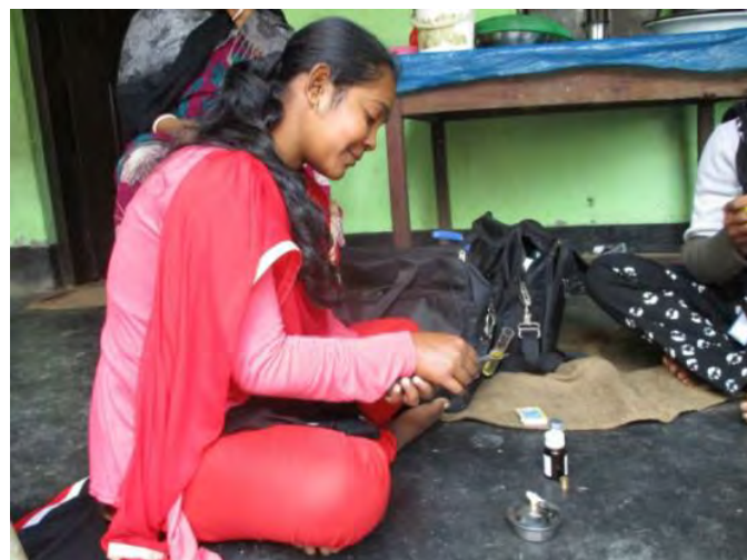
Pre-natal care at the village level: GK-paramedic checking a pregnant woman’s urin probe.

Gonoshasthaya Kendra (GK) has proven that it is possible to reduce maternal mortality substantially. The main issue is to ensure that all pregnant women get competent assistance, though not necessarily from a university-trained physician.