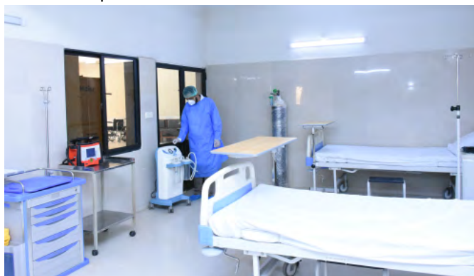
One of the HANDS supported Isolation Centres established by Government of Sindh

- 4,566 Children, Pregnant and Lactating Women's received nutrition supplements that is RUTF, IFA, MNP through seven Out Patient Therapeutic Programs (OTPs) through 95 Marvi Workers and 75 LHWs in district Tharparkar.