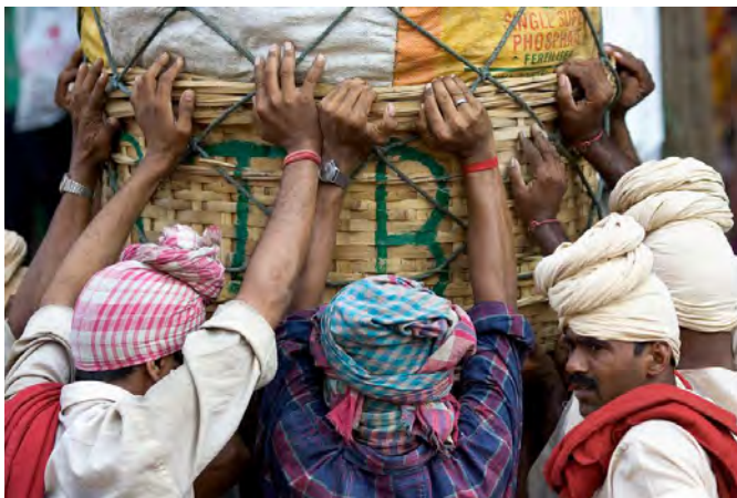
Informal workers don't get a monthly pay cheque or bank transfer. Their cash flows are dependent on them working

On March 24, at 8pm, India's Prime Minister Modi announced that, from midnight onwards, all of India would be under lockdown. Markets would be closed. All transport, public as well as private, would be disallowed. A nation of 1.38 billion people would be locked down with no preparation and with four hours' notice.