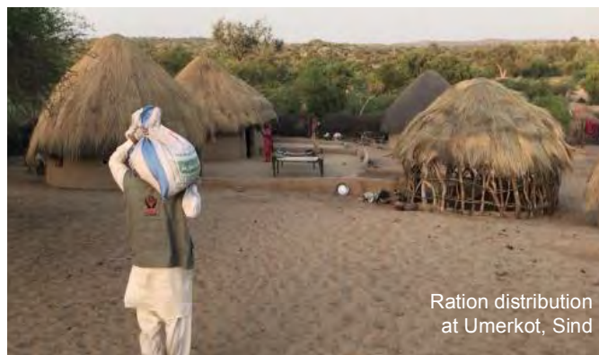
Ration distribution at Umerkot, Sind

- 500 rickshaw drivers in Karachi are continuously being supported in Guza.