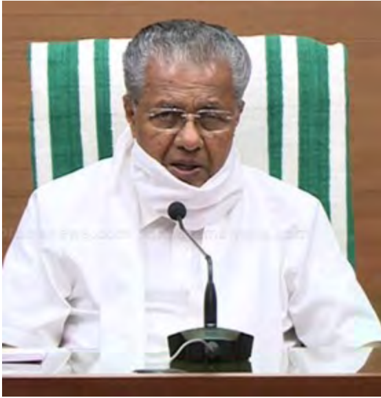
Pinarayi Vijayan Chief Minister